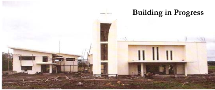
Building in Progress