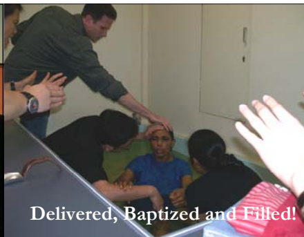
Delivered, Baptized and Filled!